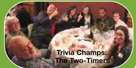
Trivia Champs: The Two-Timers

Proceeds from Trivia Night support programming which allows us to offer area schools our experiential workshops in nonviolent conflict resolution and peacebuilding.